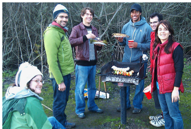
Cookout at Point Reyes.