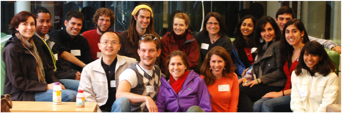
ERGies at Google.