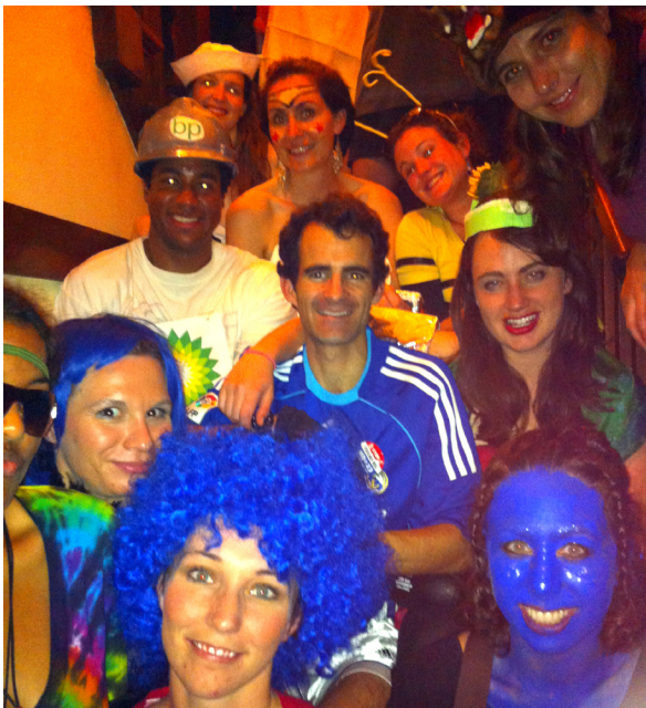
ERGies at Halloween.

become more versed in the language of electric grid system operators, and challenged myself to come up with solutions to problems that are indeed very hard. ERG is not only filled with people of the highest intellectual caliber but also with a heart of gold. Whether I was trying to solve some problems in control theory, trying to find a summer research opportunity in China, or improving an essay for an NSF application, I always found someone at ERG that I could approach with a question, and they always had the time to share their knowledge and experience with me. Coming to ERG is one of the best decisions I have taken and I am sure that it will open many more doors to many more adventures.