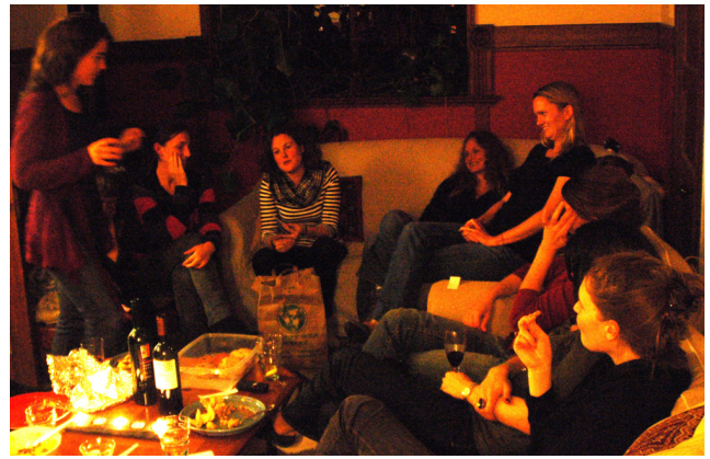
ERG women's potluck. laughing - I am very proud to call myself an "ERGie."

I cannot begin to express my thanks to ERG. They let me, the most hated of all species - a lawyer - into this fabulous program. A couple of years ago, I decided to shift from environmental law to policy. While few people questioned my move away from practicing law, several wondered about my choice to become, once again, a grad student. I have to admit, there have been moments when I have questioned it myself - most notably while walking to 8a.m. classes and struggling with a certain spherical cow (my last problem sets dated back to high school). But on the whole, the experience has been so great, there is no question in my mind that it was the right choice. I have learned a tremendous amount. More importantly, I have had the chance to be a part of the incredible community that is ERG. I am regularly amazed by my classmates - for their breadth and depth of knowledge, as well as for what generous and caring people they are. I am also deeply indebted to the ERG faculty and staff for their time, encouragement and support (even, and perhaps especially, when it felt least deserved). I am proud to have (mostly) tackled that cow, and above all - and though it took some time to do it without