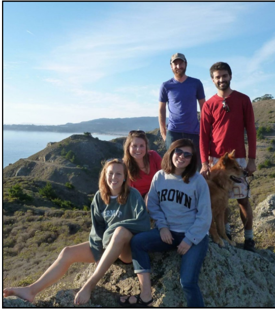
ERGies go to Bolinas