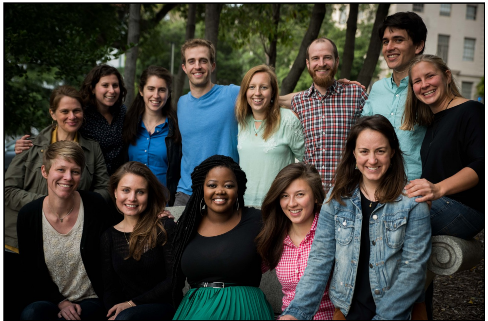
ERG Master's Graduates 2016