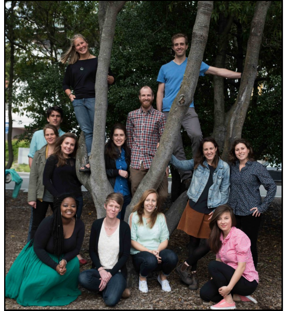
ERG 2016 Master's Graduates