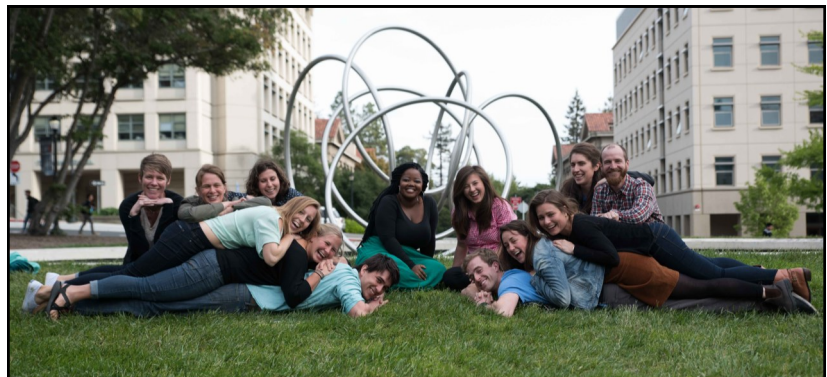
ERG 2016 Master's Graduates

Please consider making an annual donation to ERG. Donations to our fellowship funds make a huge difference for our students and help bring their research to a world in much need of it. Contact our office or visit our website to give.